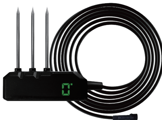
WCS-3 for Aqua-X Control System