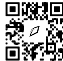
Terralink Substrate Sensor Installation